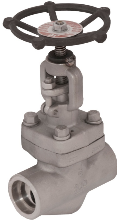
FIG. G800 GLOBE VALVE

BS 5352, ASME B16.34 Connections according to: ANSI B 1.20.1 (NPT) ANSI B 16.11 (SW) CE